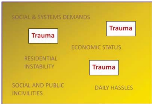
Figure 1: The traumatic context of urban poverty includes increased risks of discrete traumas, such as violence and crime, as well as difficulties that exacerbate trauma’s effects.

infestations, difficulty finding a safe way to get children to and from school, and multiple daily hassles due to inadequate access to resources and opportunities. (Figure 1)